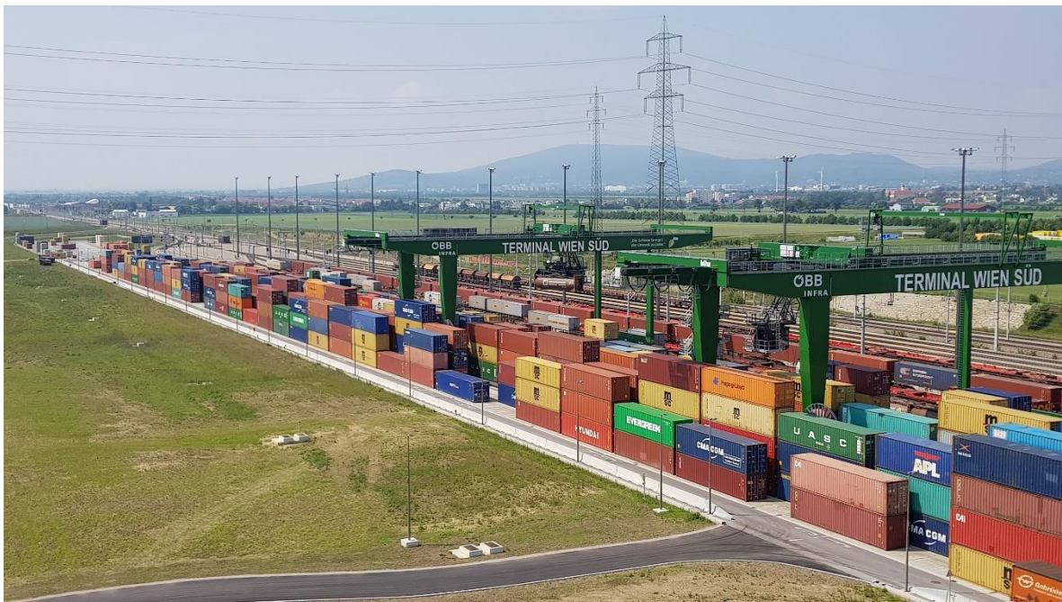
Terminal Wien Süd