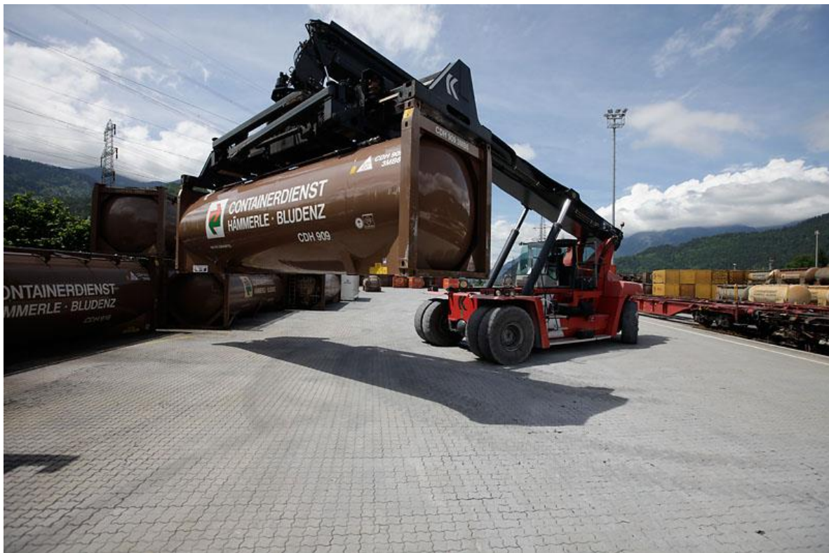
Terminal Bludenz