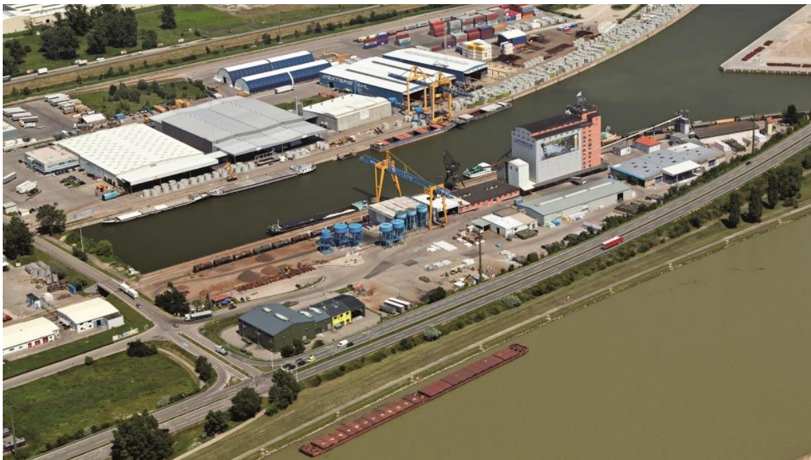
Port of Krems