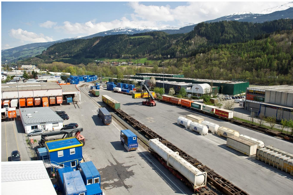
Terminal Hall in Tirol