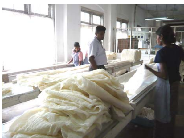
Company visit to garment production site

During the mission four companies have been visited: Hirdaramani Washing Plant, Puritas Ltd, Kenilworth Estate, Ginigathena and Wijeya Newspapers Ltd. (for further information please see chapter 4.4.3)