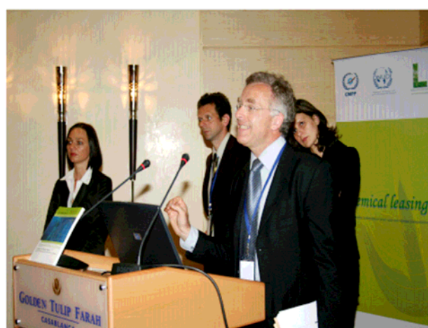
Launch of Chemical Leasing activities in Morocco