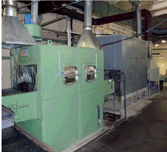
New degreasing and washing machine