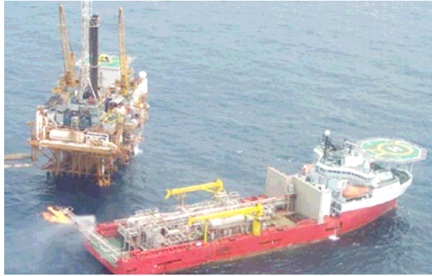
Potential Chemical Leasing applications for companies Hydromex and Marecsa