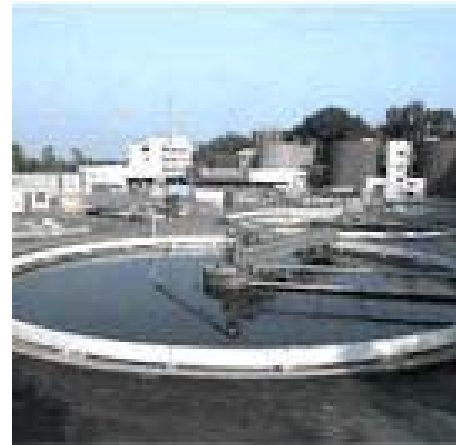
Water treatment plants in Russia