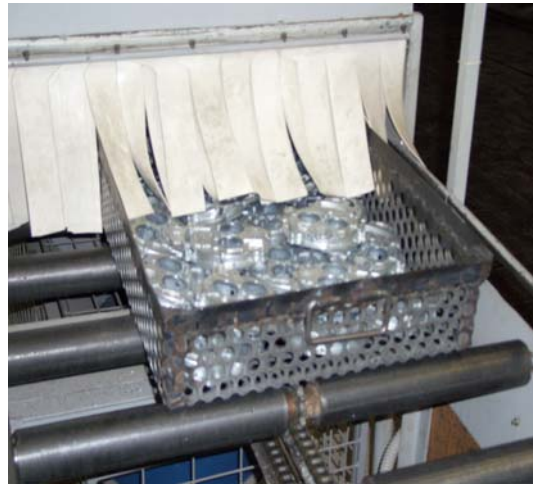
New drying chamber

In addition to that, the NWICPC had meetings with St. Petersburg Newspaper Complex (January 2008), with Ecros, Ltd. (May 2008), with Notech, Ltd., chemical producer and supplier (June 2008). The specialists and managers of these companies were informed about Chemical Leasing business models. The possibilities of Chemical Leasing application in these companies are now under analysis.