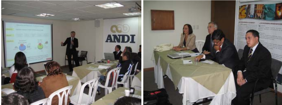
Workshops in Bogota, Cali and Medellin

Multiple site visits were conducted to companies from different sectors and letters of intent were signed by several companies. The following enterprises were visited during the mission: