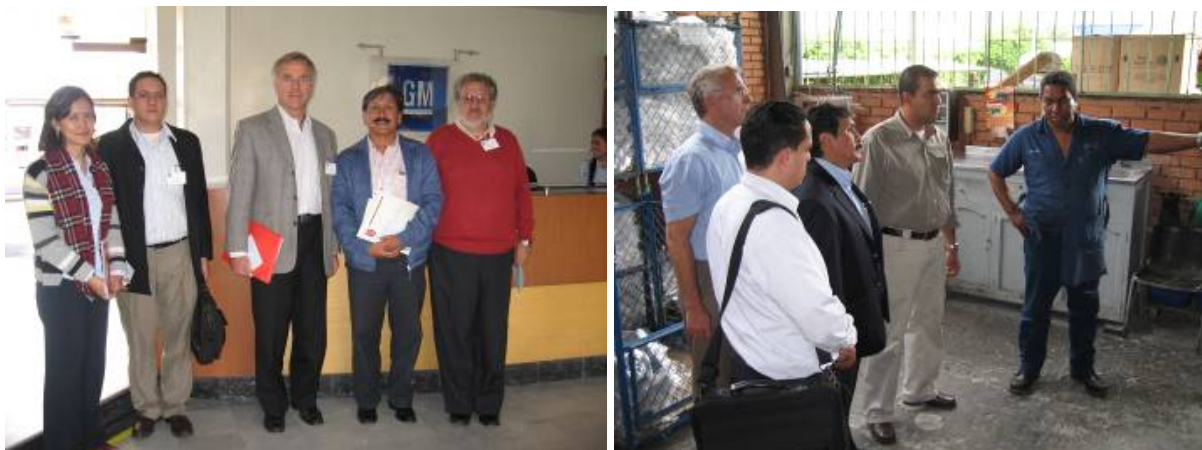
Company visits at GM Colombia and Roy Alpha.