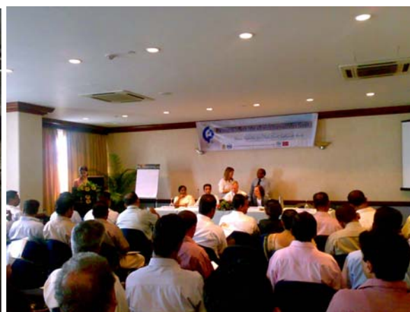
Workshop on Chemical Leasing