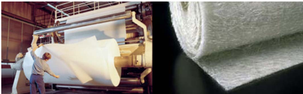
Site visit to Owens Corning Mexico

One of the most important product applications in Mexico are veils and specialty non-wovens for acoustical and thermal insulation paneled ceilings. Adhesive are applied on fiber glass in order to produce sheets.