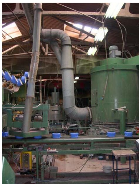
Company visit to Metalac production site

The objectives of this first mission were to hold an international workshop on Chemical Leasing, to visit the selected companies, to establish cooperation agreements and provide assistance to the NCP. More than 100 company representatives participated in the workshop.