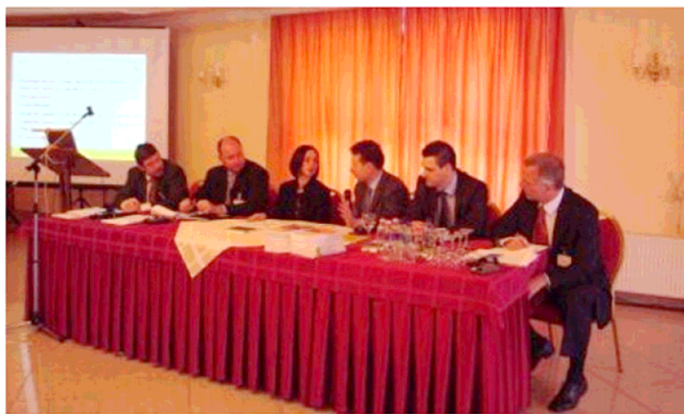
Panel discussion on Chemical Leasing and REACH in Balatonfüred

The conference took place in Balatonfüred, Hungary on March 6-7. The meeting was initiated by the Austrian Federal Ministry of Agriculture, Forestry, Environment and Water Management in cooperation with the Hungarian Government and UNIDO. The conference aimed at presenting Chemical Leasing as a promising approach towards REACH compliance and at identifying potential pilot projects. Approximately 80 representatives of the private and public sectors from more than 10 countries participated in the conference. At this event the book “Chemical Leasing goes global” was officially presented, which was jointly published by UNIDO and the Ministry of Environment of Austria. The program and a comprehensive report of the conference can be found at http://www.chemicalleasing.com/conference.htm .