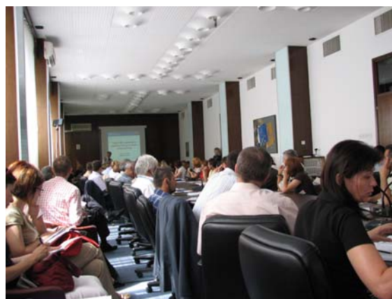
Workshop on Chemical Leasing

The workshop was organized in cooperation with the Serbian Chamber of Commerce and took place in the office of the Chamber of Commerce in Belgrade. The slides were translated and simultaneously translation of the presentations into Serbian was provided.