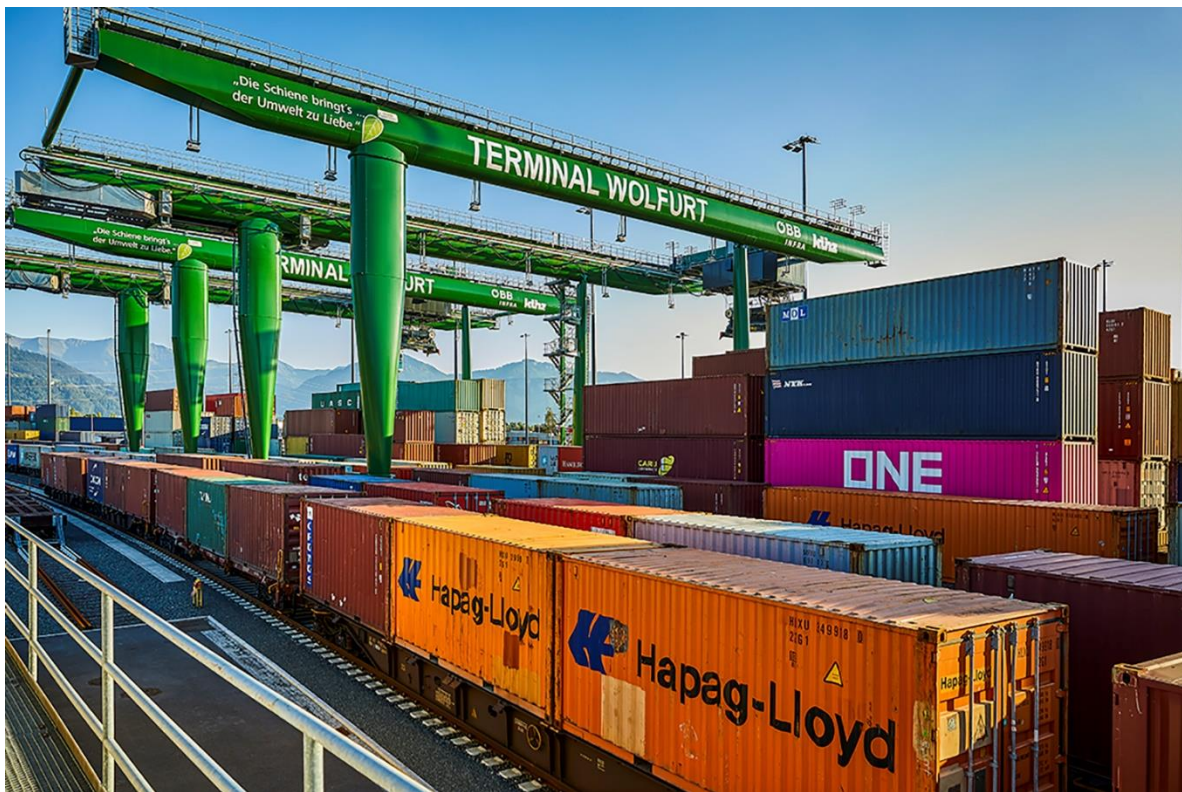
Terminal Wolfurt