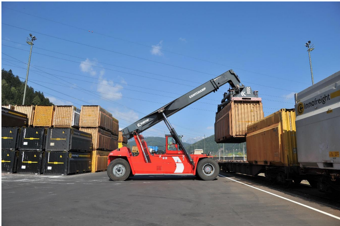
Terminal St. Michael